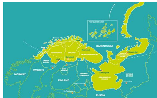
Figure 1: The geographical area, including the sea, covered by the Kolarctic Programme.

Based on the European Commission's framework for the new Interreg programs, which define several policy objectives (PO), Interreg Specific Objectives (ISO) and specific objectives (SO), the programme work has focused on further developing the areas: